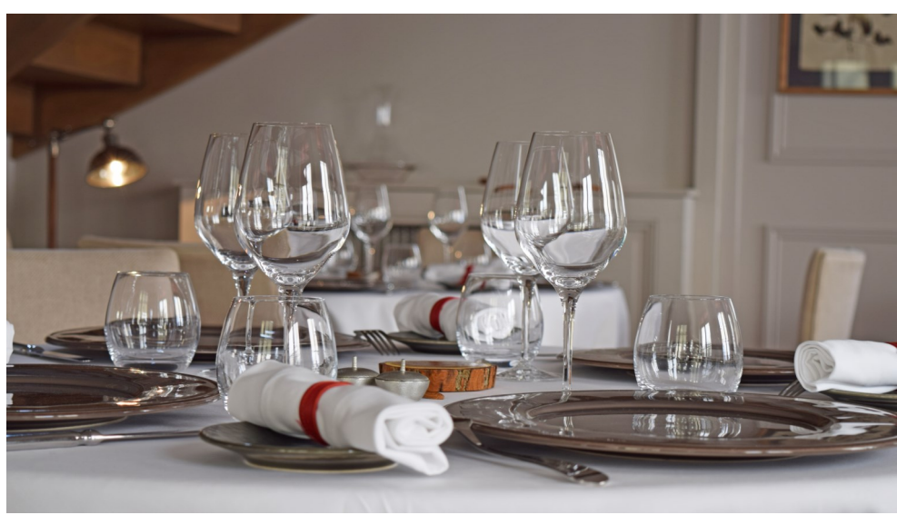
Logis de la Cadène

Function room with bedrooms: rates on a sliding scale (contact us)